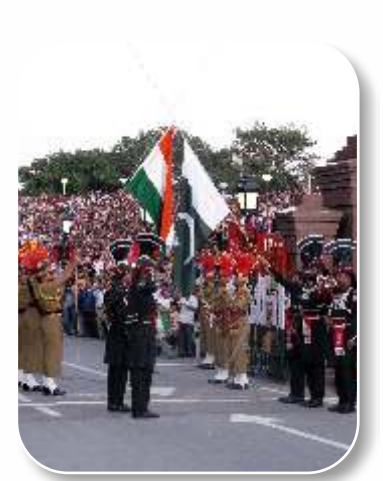
Retreat ceremony at Wagah Border